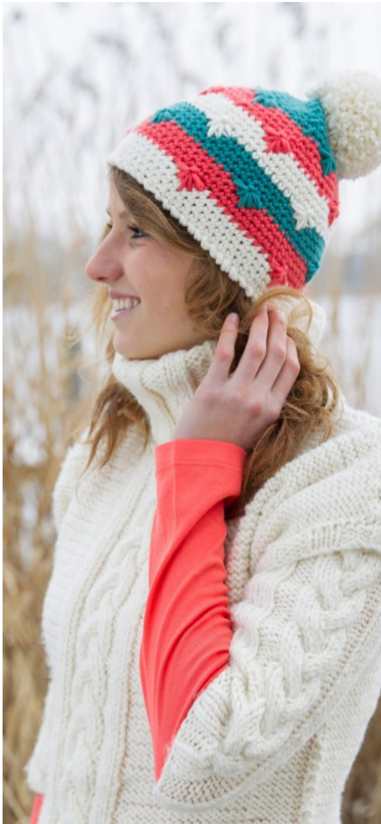
Snowflake crochet hat Copyright by Gründl Translation: Woolpedia